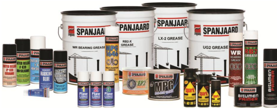
BMG's range of Spanjaard lubricants, oils and greases for efficient lubrication 2018

BMG's extensive range of sealing products encompasses Spanjaard lubricants, oils and greases, which are suitable for industrial, automotive, marine, mining and consumer applications.